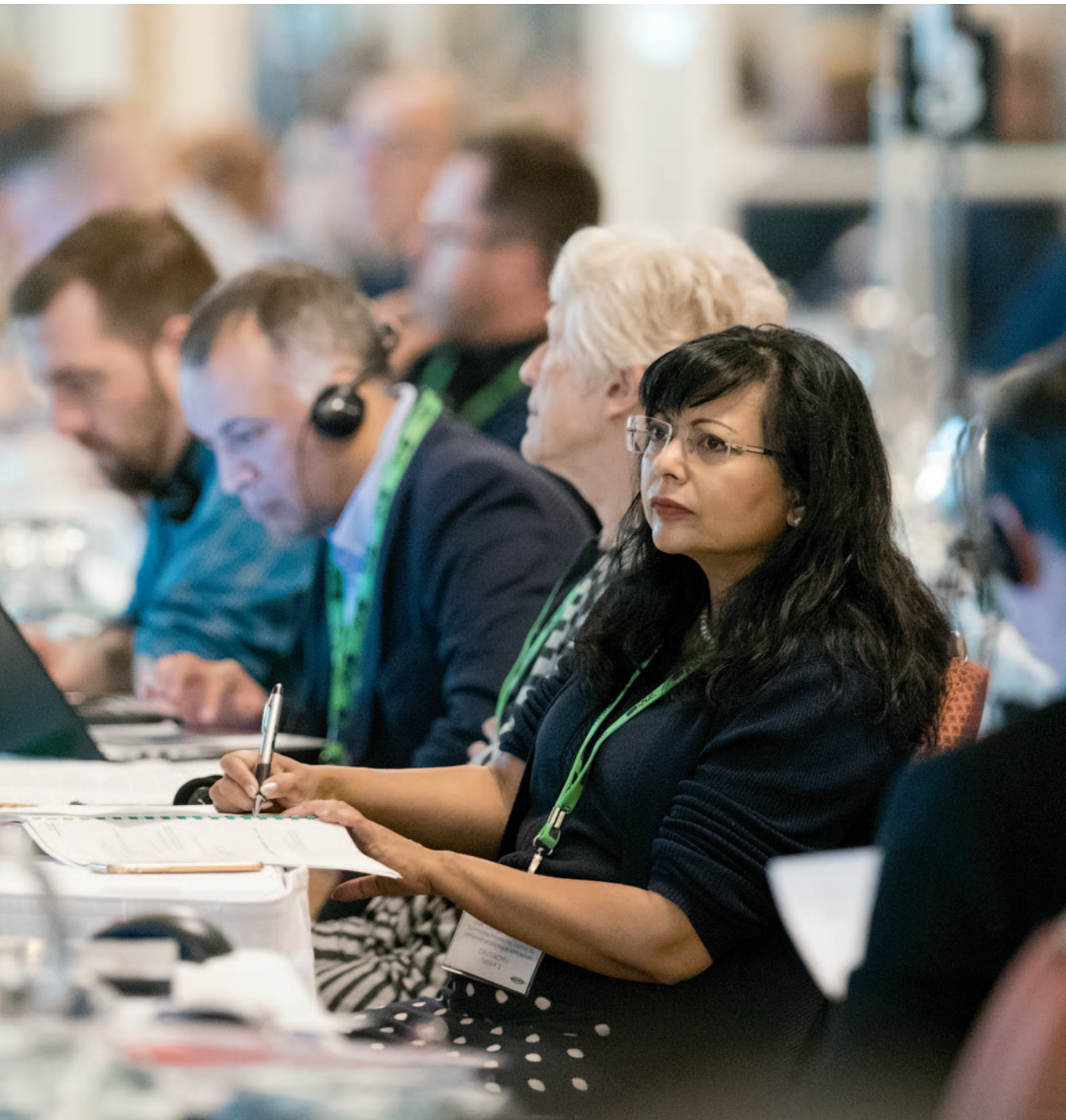
CAUT Council Meeting