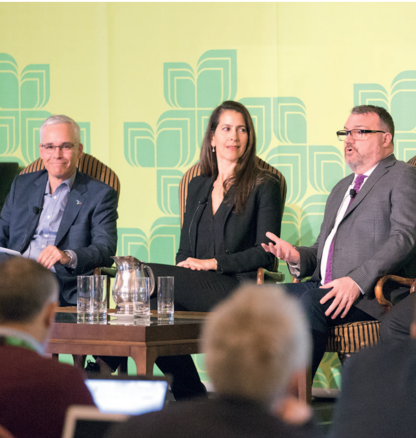
CAUT Council Meeting / Election Panel