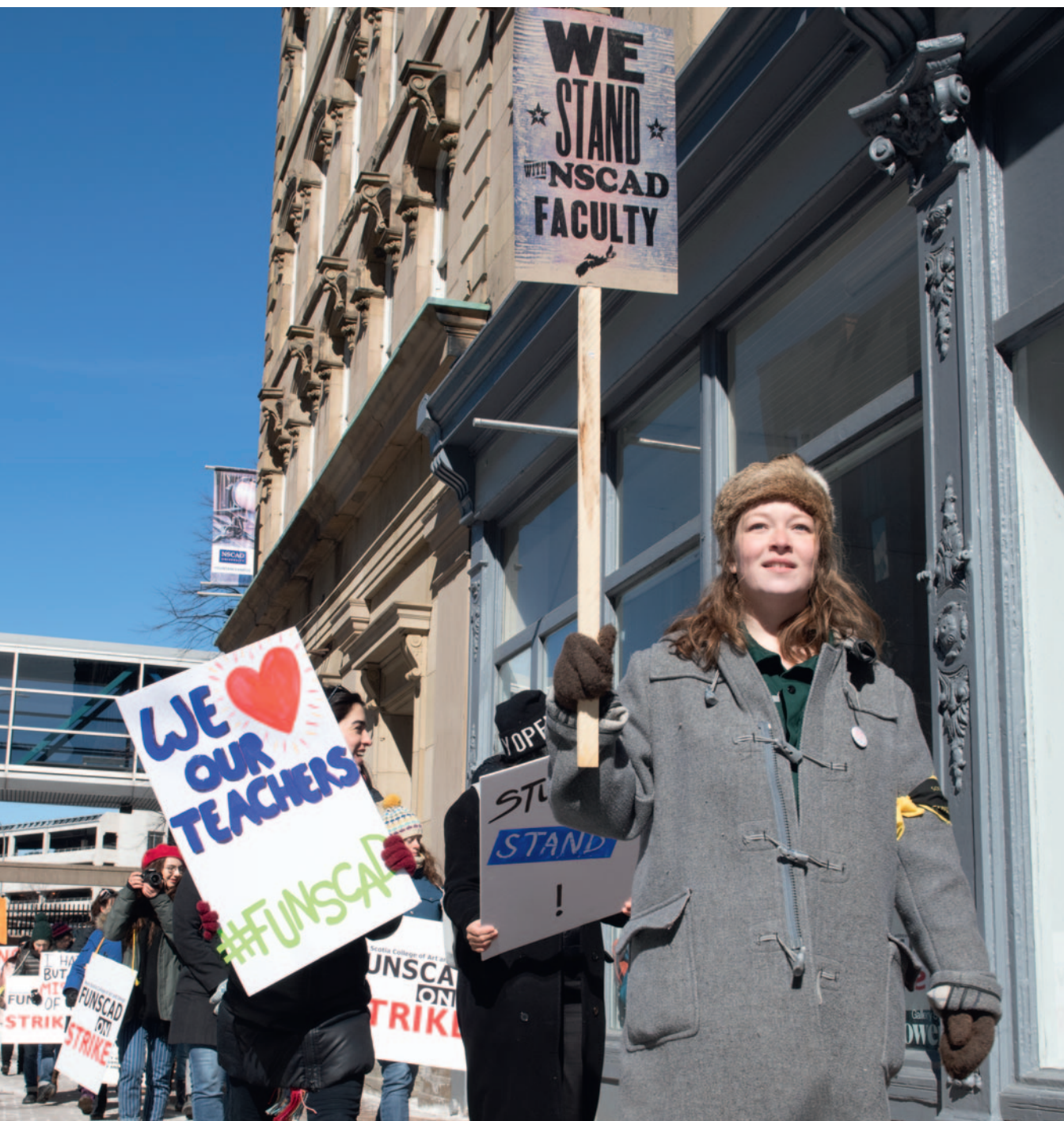
FUNSCAD strike action